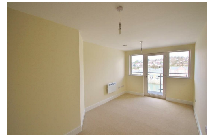
APARTMENT (EPC RATING: C)